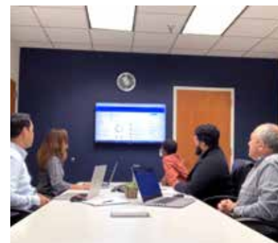
Invento New Jersey Office