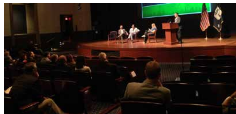
Invonto CEO presents at SelectUSA

Trusted brands trust Invonto with their digital transformation We have been satisfying customers across America for more than a decade through innovation, superior service and revenue-generating digital products. We've partnered with top brands like Transamerica, D. R. Horton, Epicor, Sealed Air, Sharp, YMCA, West, and many others to create transformative digital