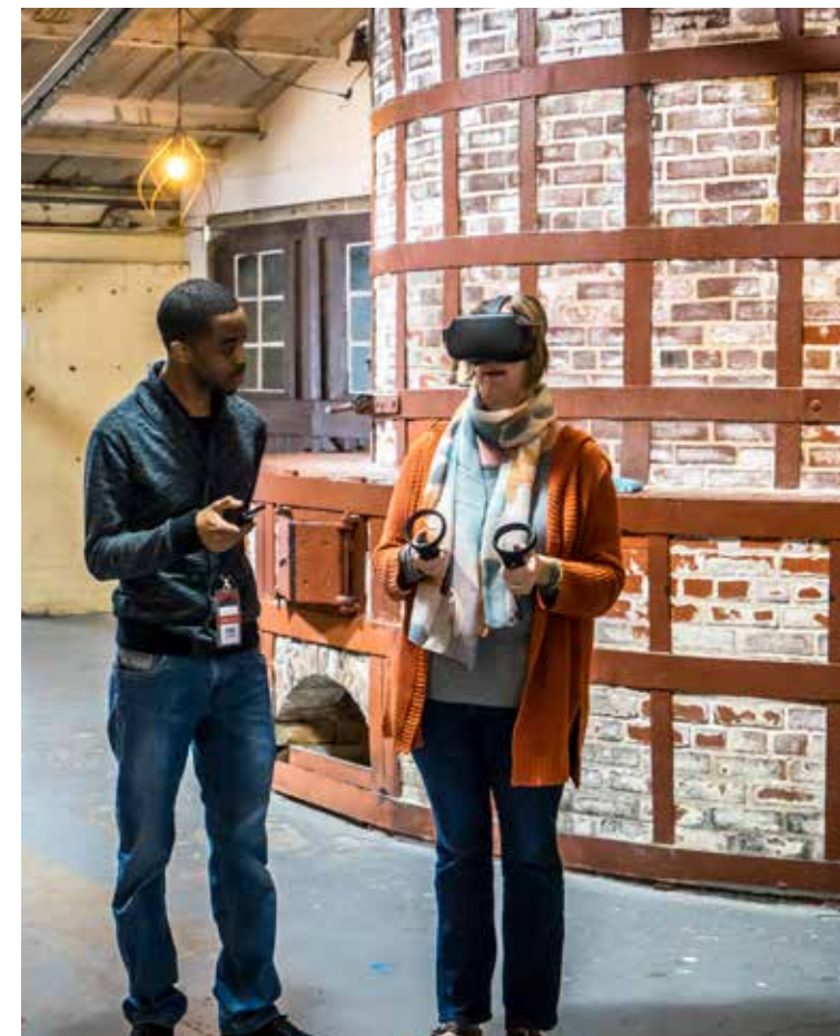
Invento virtual reality demonstration in Flemington, New Jersey

Invento recently launched the Virtual Reality Roadshow, a series of interactive events designed to educate local businesses on the benefits and practical applications of VR technology. The program is the only one of its kind and marks an important step in a bigger agenda for New Jersey: establishing the state as a hub for technology innovation and helping local businesses grow through technology adoption.