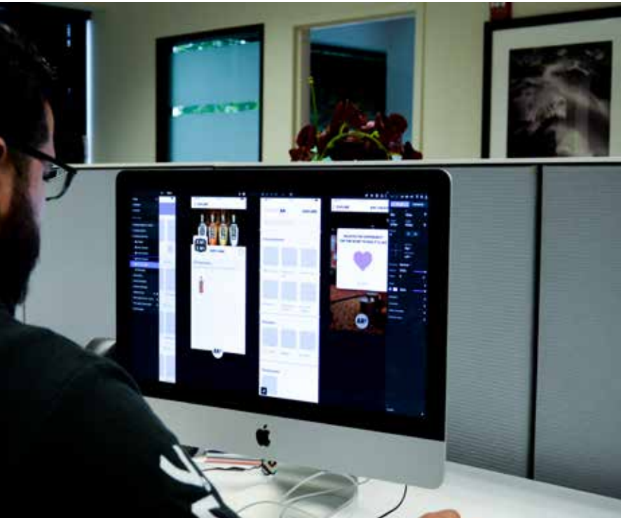
Invento has designed and developed mobile and web applications for over 10 years

option to work remotely. And when in the office, the team is encouraged to participate in a number of light-hearted activities to help them prioritize their mental and physical health.